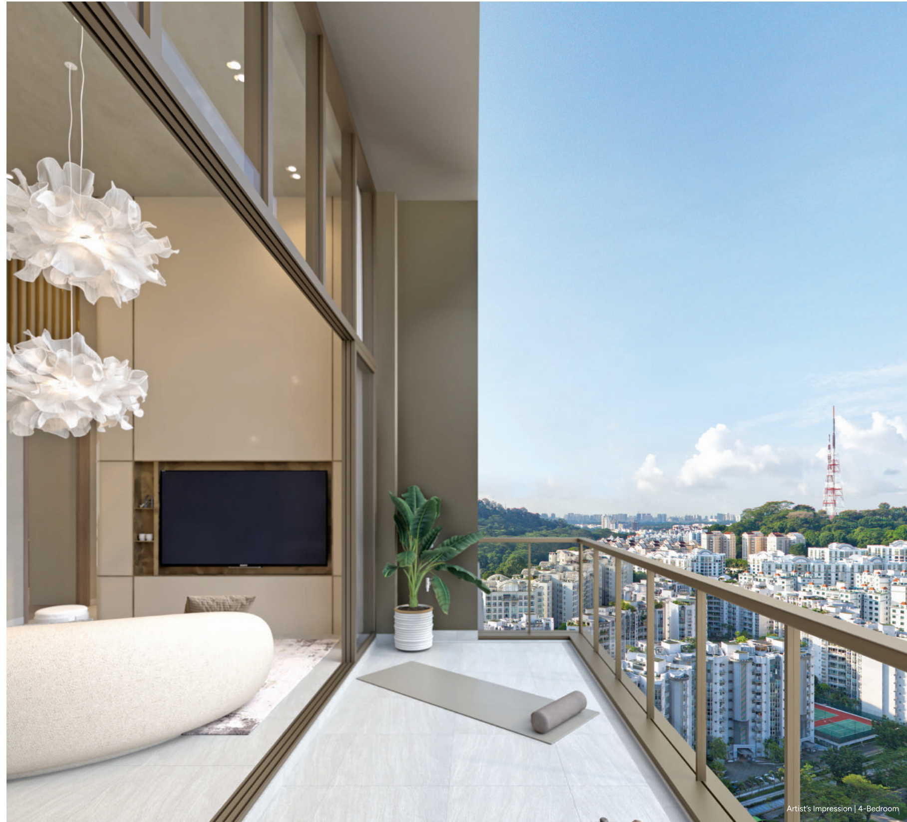
Artist's Impression | 4-Bedroom

*View from selected units. Images are for illustration purposes only.