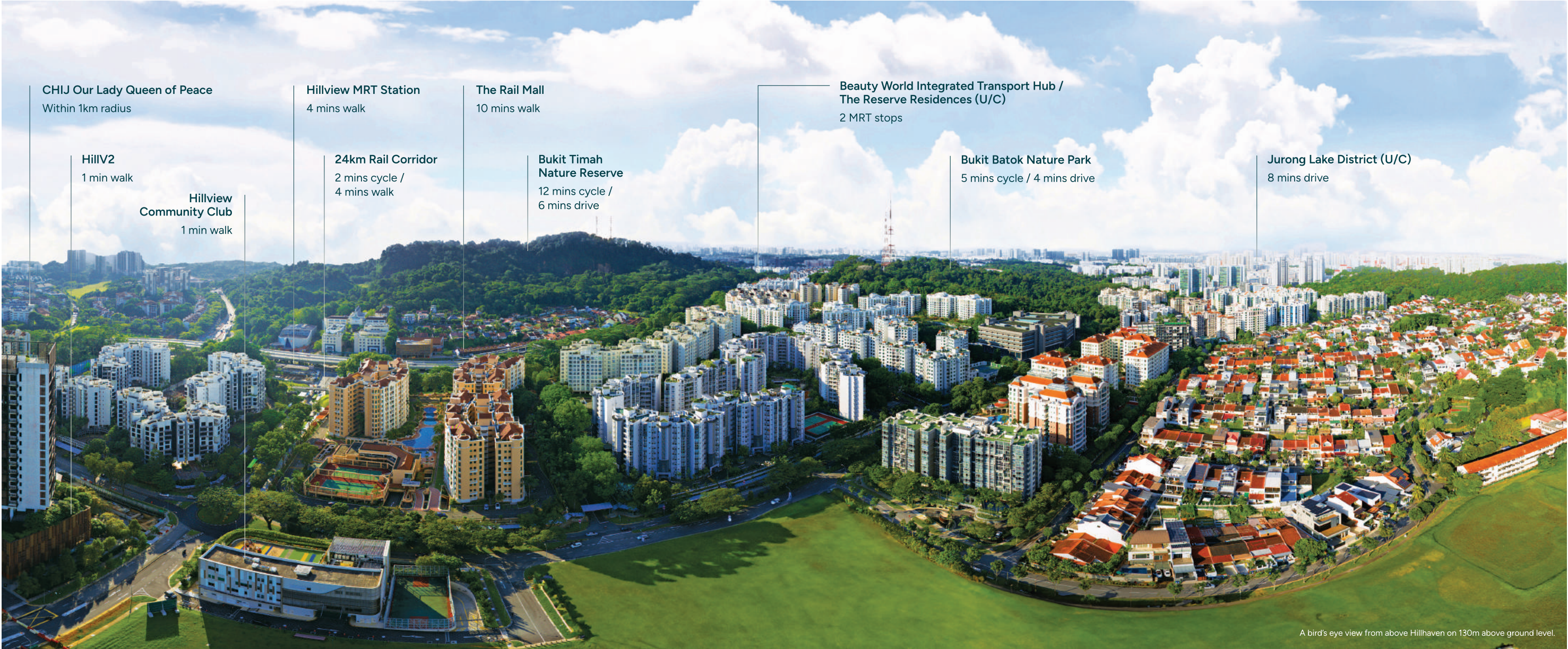
A bird's eye view from above Hillhaven on 130m above ground level.