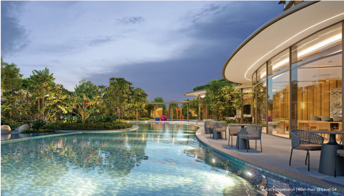
Artist's Impression | 50m Pool @ Level 04

At Hillhaven, you will enjoy opportunities for enrichment. Whether you're seeking dynamic outdoor adventures like biking or prefer the tranquillity of community gardening, Hillhaven gives you room for constant growth and learning.