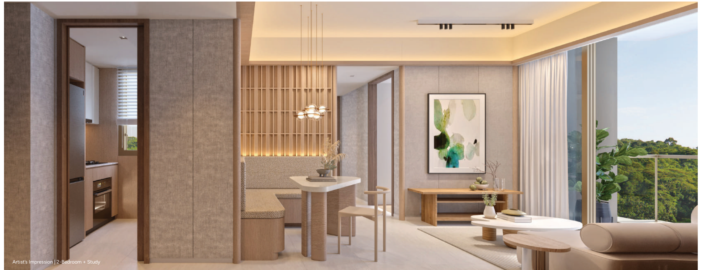
Artist's Impression | 2-Bedroom + Study

Every 2-bedroom + study unit comes with an enclosed kitchen with natural ventilation and a smart gas hob connected to the iAppliances app. Enjoy extended living space seamlessly connecting to your balcony, offering indoor comfort and outdoor relaxation.