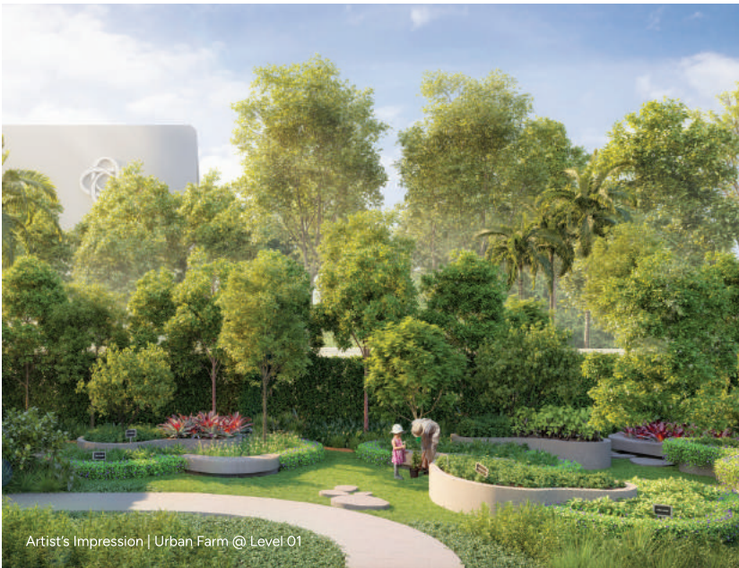
Artist's Impression | Urban Farm @ Level 01

Step out of the urban hustle and come home to a relaxing swim in the 50m pool or spray down your bicycle at the bikers' corner after a satisfying adventure through the 20km Western Adventure Cycling Loop. Find a space that nurtures the mind, body, and soul.