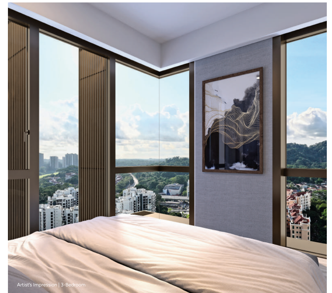
Artist's Impression | 3-Bedroom

Picture waking up to the soft hues of sunrise from your master bedroom through captivating L-shaped windows, or unwinding in the evening with views of breathtaking sunsets right from your balcony.