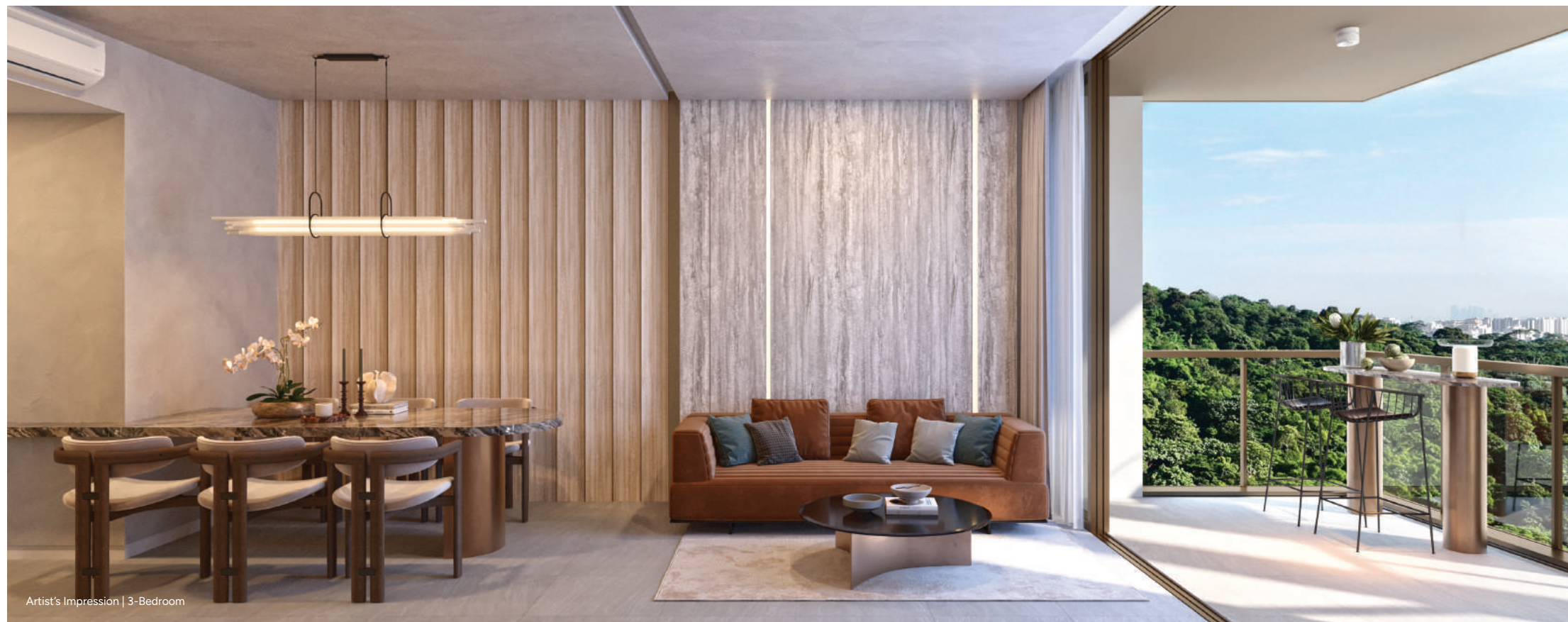
Artist's Impression | 3-Bedroom

Each layout has been meticulously designed to create the most efficient home, ensuring you get the very best use of space. Transform the attached study room into your own dedicated hobby area or a convenient home office, allowing you to pursue your interests and work comfortably from home.